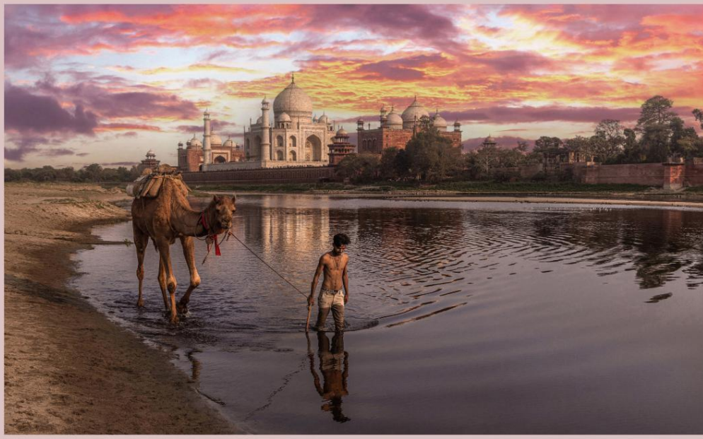
Best of Category - Portrait "The Warrior" by Nikki Washburn