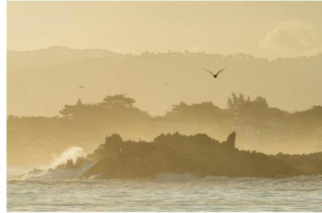
Third Place: Greg Trainor