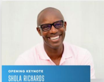
OPENING KEYNOTE SHOLA RICHARDS

Discover new ways to transform your business with an inspiring keynote presentation.